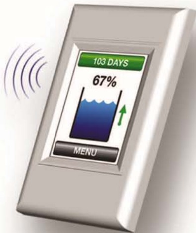
Wall Mount Option

The Smart Water LCD unit features a high resolution full colour 2.8" touchscreen. The user interface to the system is intuitive and is designed to be very simple to operate. There are two options available with the LCD unit, a desk-mount version and a wall-mount version. The desk-mount option features an adjustable angle screen, non-slip feet and is supplied with a plug pack power supply. The wall-mount option has a detachable faceplate and is designed to fit into most standard electrical flush boxes. The wall-mount option is also supplied with a wall-mount power supply for ease of installation. The LCD units are supplied with high performance dipole antenna, however for long range applications these can be upgraded to the optional ultra long range Yagi antenna. The Smart Water components are constructed of the highest grade materials and components. These include ultra-UV resistant marine grade plastic and a high speed microcomputer processor offering superior speed, performance and reliability.