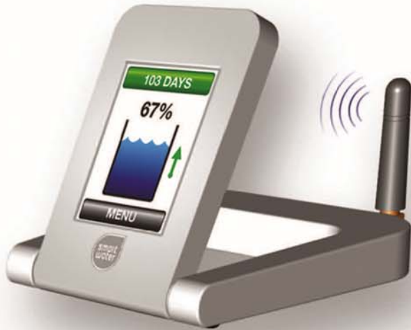
Desk Mount Option